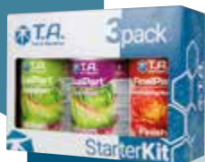
DualPart Starter Kit