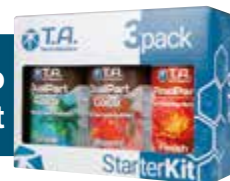
DualPart Coco Starter Kit

Available in : 0,5L • 1L • 5L • 10L • 60L • 1000L