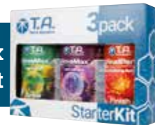
NovaMax Starter Kit

NovaMax® Grow and NovaMax® Bloom combine the strength of a dry concentrate with the ease of use of a liquid. Complete and effective, there is no need for Cal/Mag or additives to boost the growth of your plants!